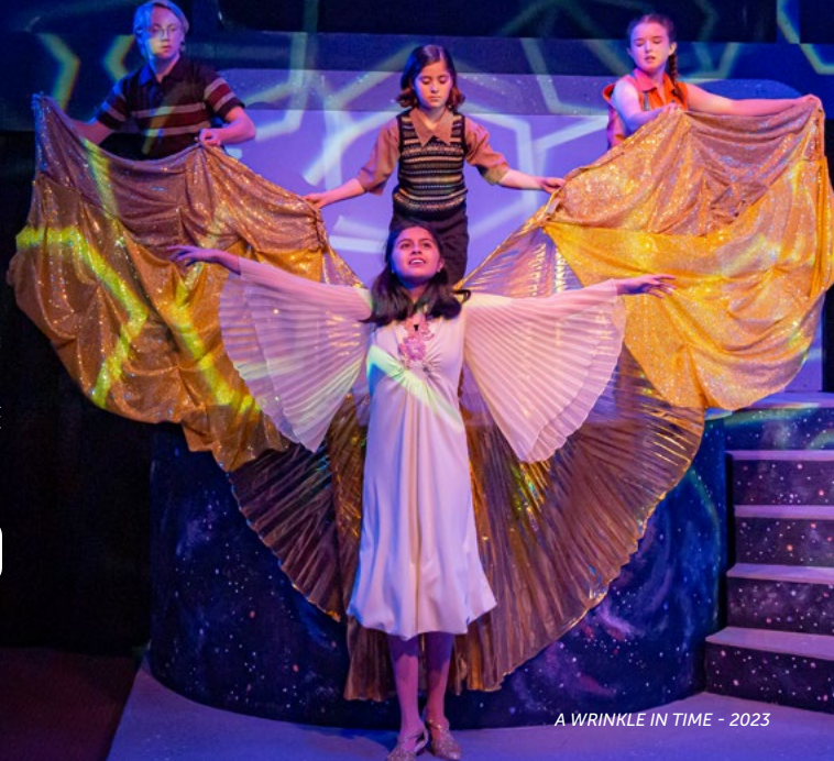
A WRINKLE IN TIME - 2023