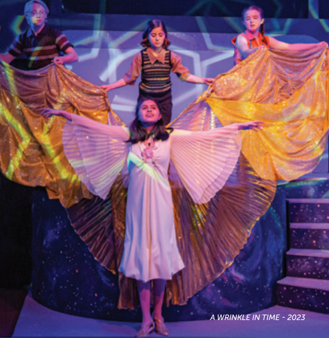
A WRINKLE IN TIME - 2023