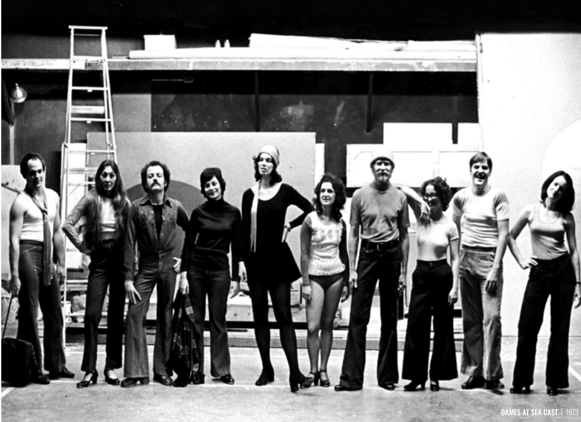
DAMES AT SEA CAST | 1973

The beloved converted library building at 888 Morro Street is bursting at the seams.