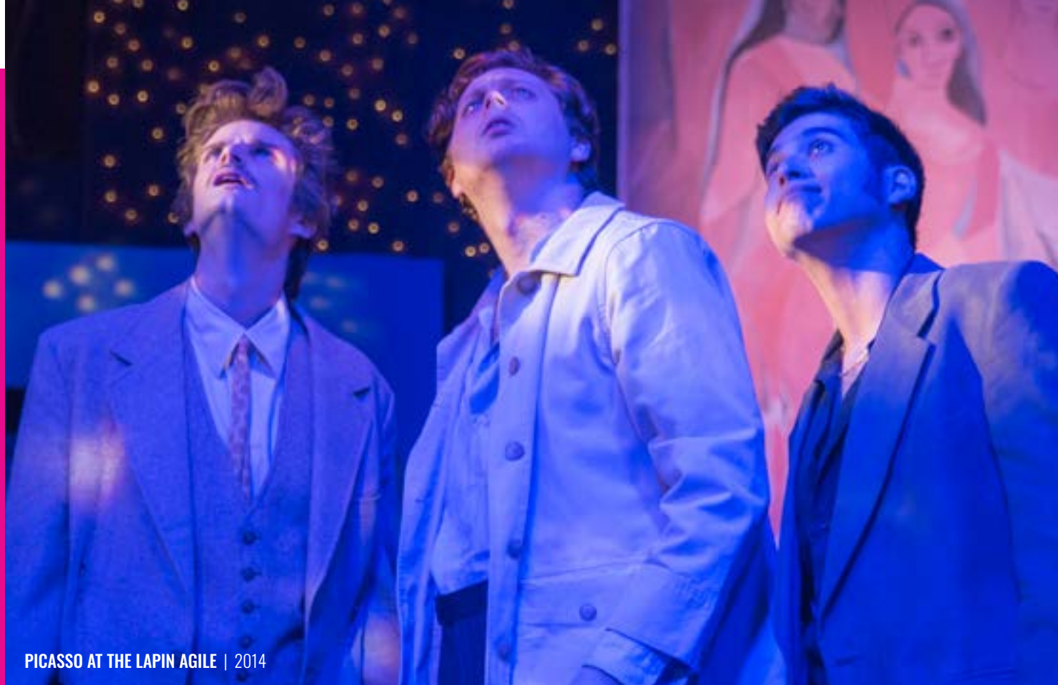
PICASSO AT THE LAPIN AGILE | 2014