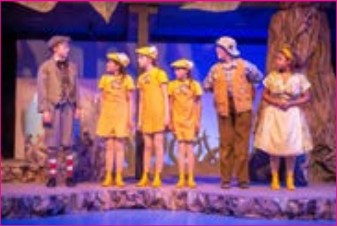
RYAN LOYD Photographer / Videographer